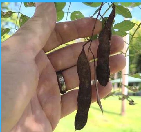
2-4" seed pods, flat