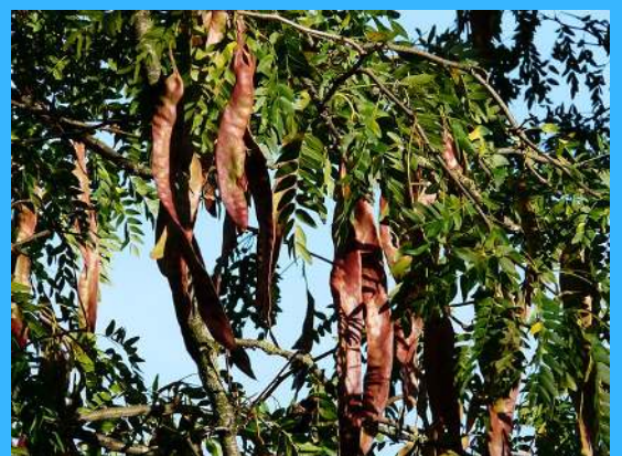
6-14" long seed pods, often curled

Infographic courtesy of growitbuildit.com REFERENCES