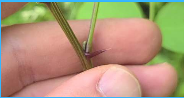
Single 1/2" thorns at branch junctures