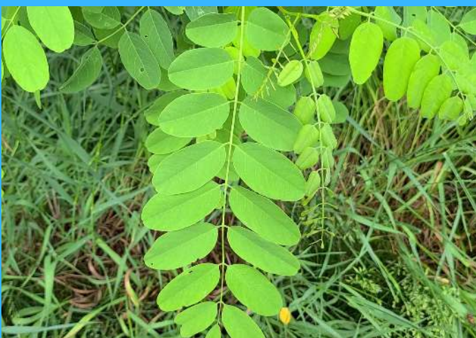
Leaves are larger