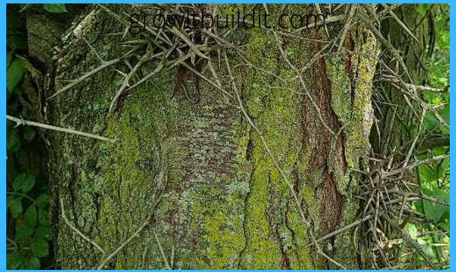
Bark is like rough flat plates