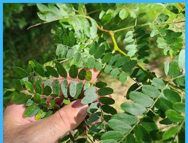
Leaves are smaller