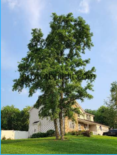
Irregular crown/shape with ascending branches