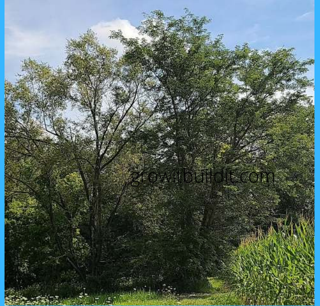
Open plume / shape