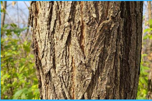
Rough, furrowed bark